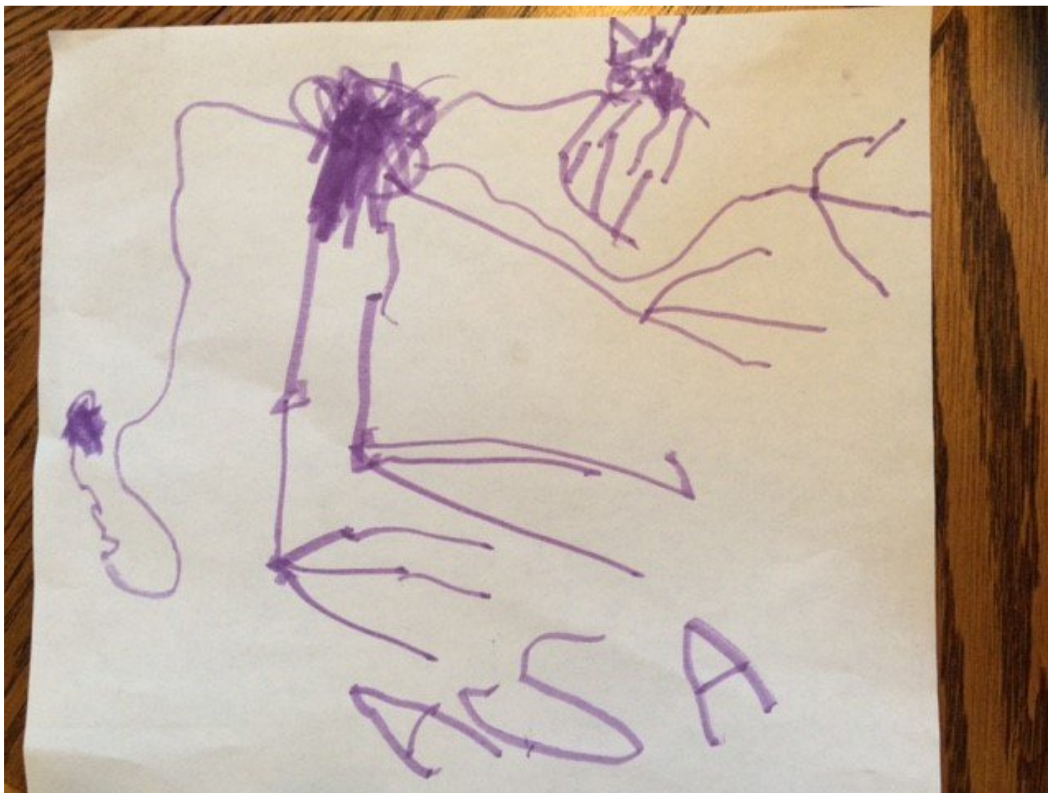
ASA AGE 4 DRAGON