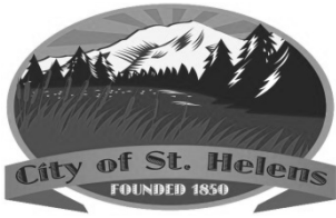
EXHIBIT H CERTIFICATE OF FINAL COMPLETION