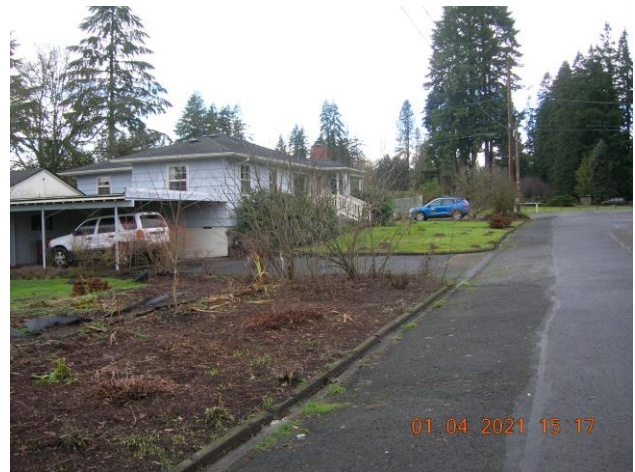
Subject property on left. Driveway approach shown with curb and gutter along Firway Lane.