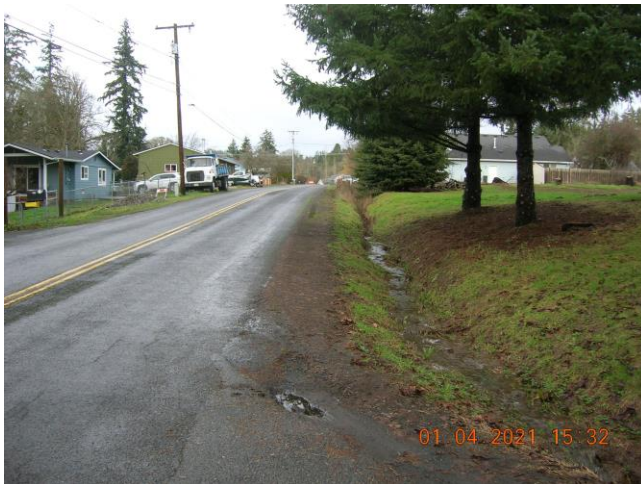
Looking north along Firlok Park Street. Subject property on right.

The subject property is a rectangular shaped lot at 20,473 square feet or 0.47 acres. It is located at the corner of Firlok Park Street (Firlock Boulevard) and Fir Street. It is currently vacant, but the applicant has received approval for a septic system for a detached single-family dwelling through the County. Firlok Park Street is a developed collector classified street without frontage improvements (sidewalks, curb, and landscape strip) on either side. Fir Street is a local street without any frontage improvements. Both roads are within the County’s jurisdiction. The parcel is generally flat sloping towards the two streets with a few sparse trees around the perimeter. There is a stormwater ditch along Firlok Park Street and along the shared northern property line.