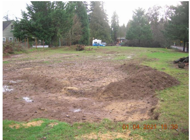
Subject property looking south to Fir Street.