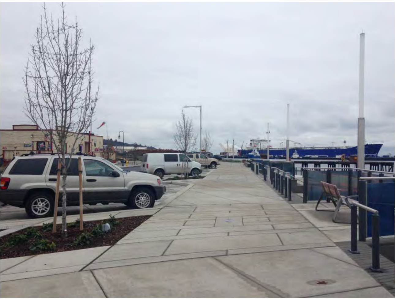
Angled parking on the riverward side of the Strand festival street would provide a place to view the water on rainy days