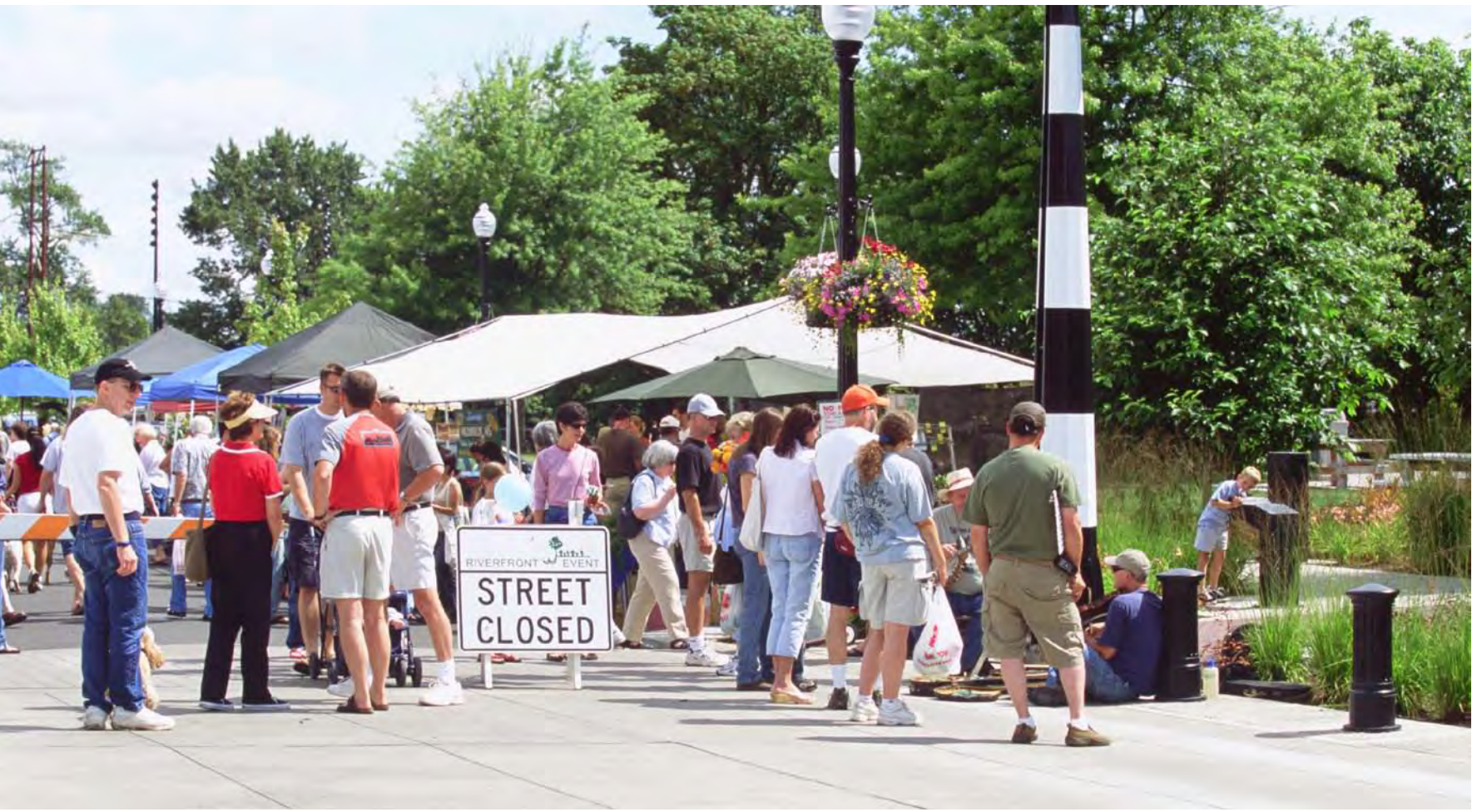
A festival street extension of The Strand could be closed to vehicles for special events

ST. HELENS WATERFRONT REDEVELOPMENT JULY 6, 2016