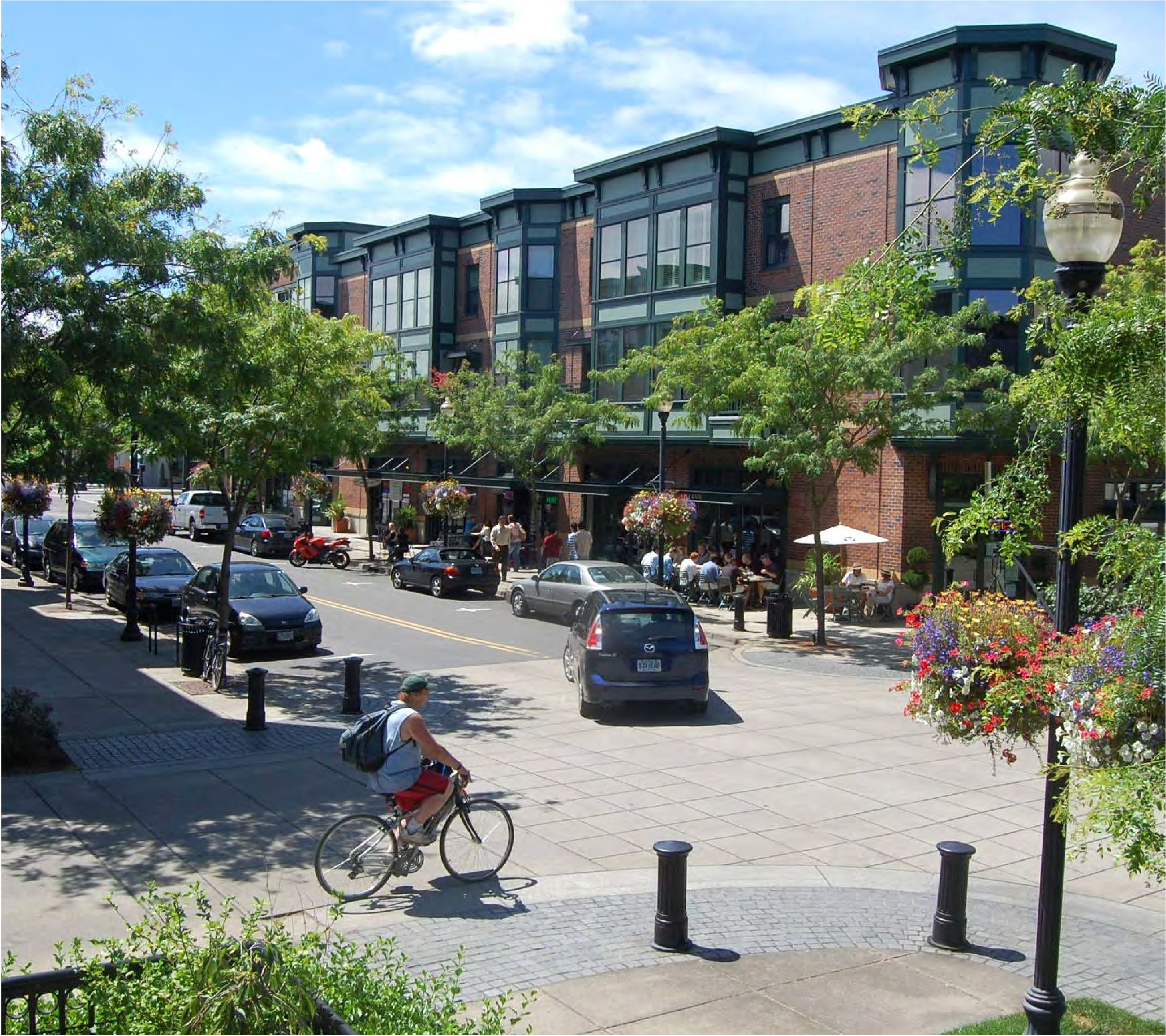
Complete Streets (walkable, bikeable, and green)