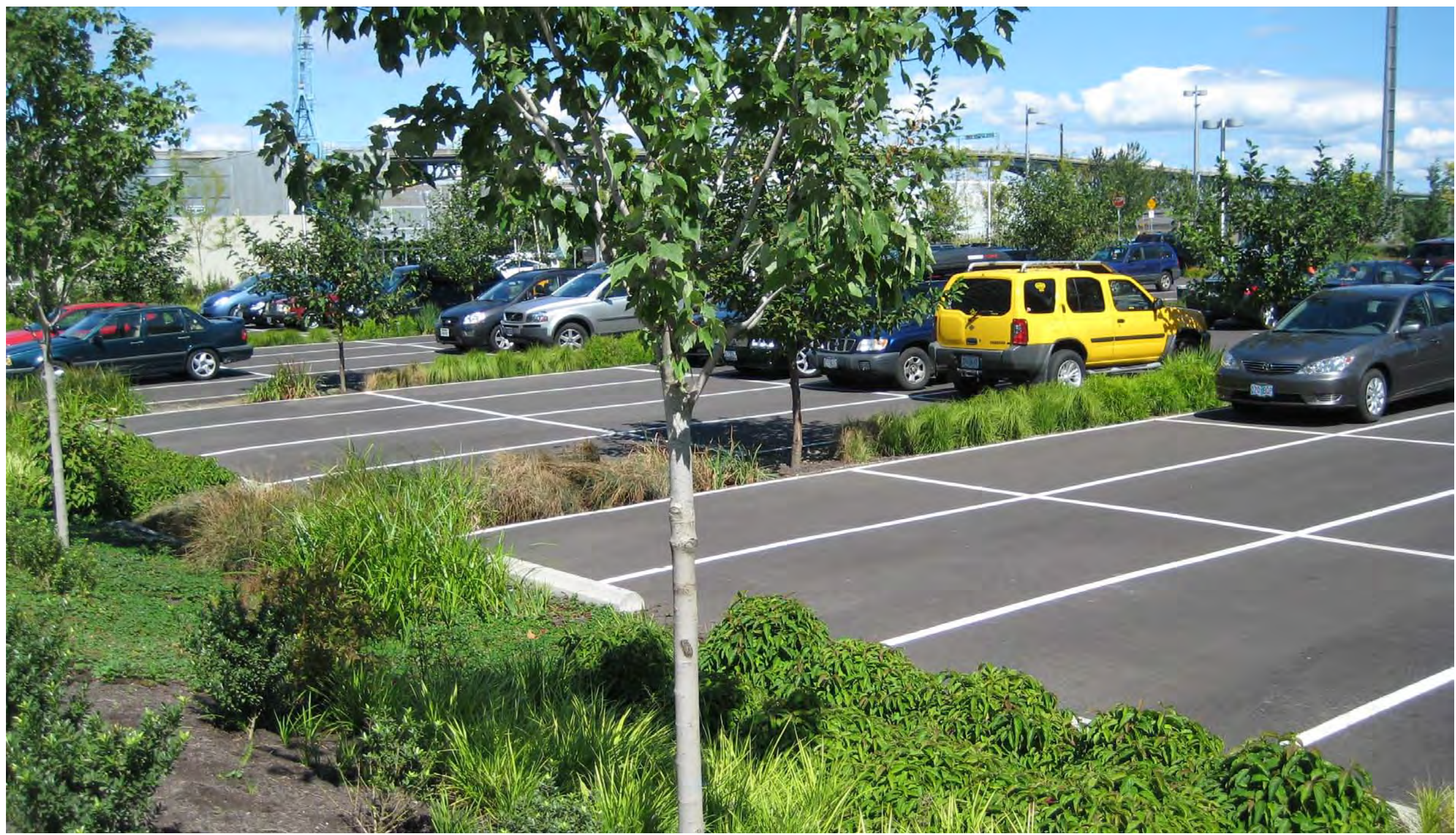
Green Parking Lots