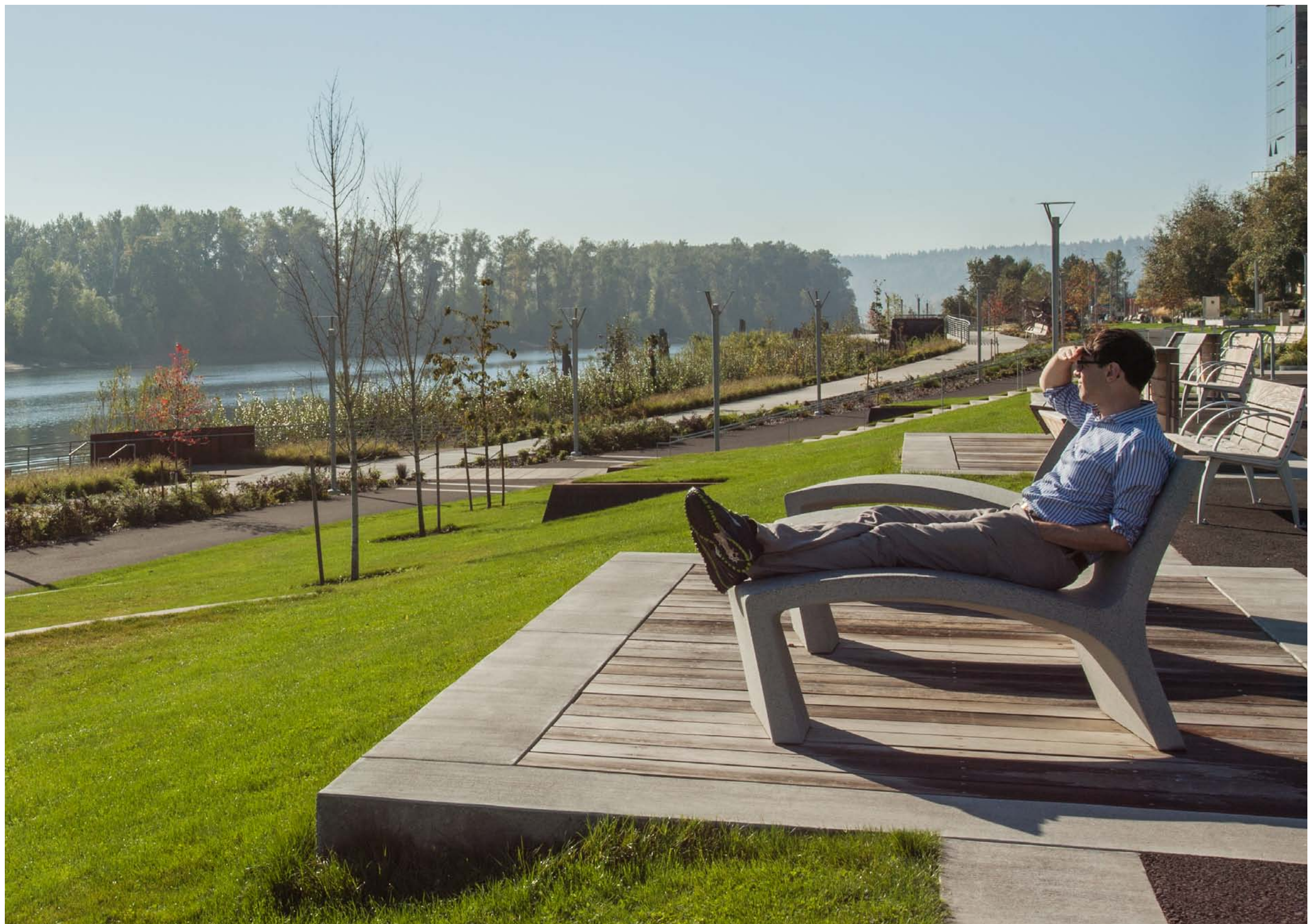
Wide Open Space (+100')