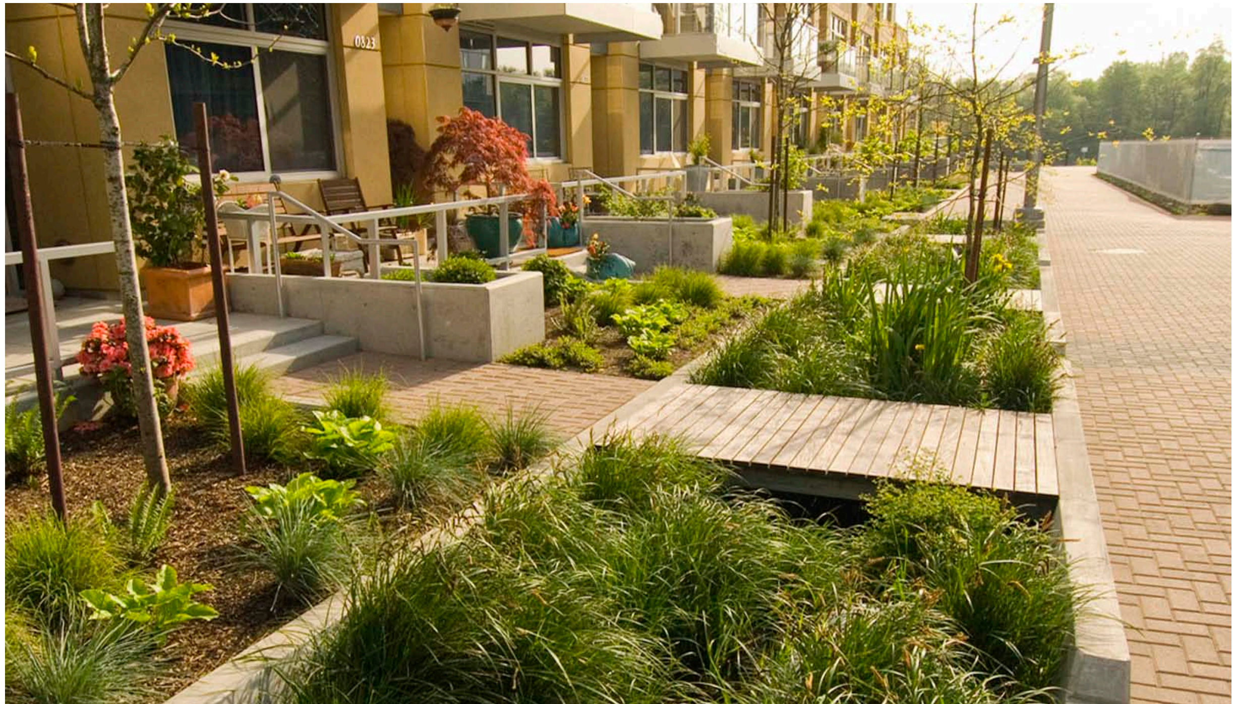
Low-impact stormwater treatment