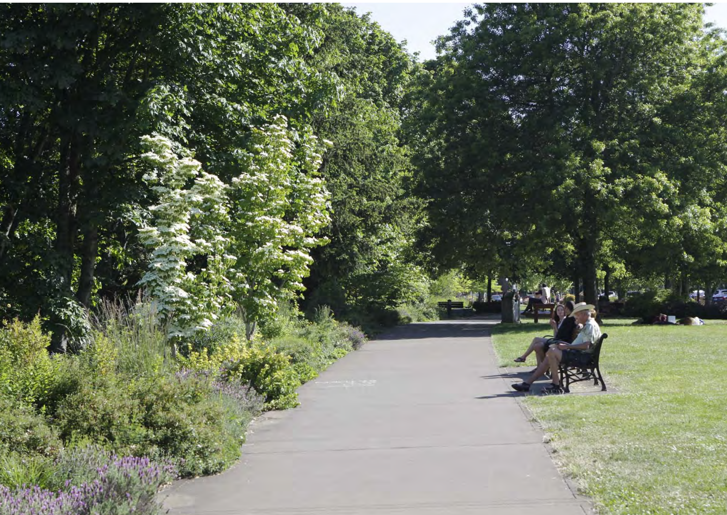
Medium Open Space (75')