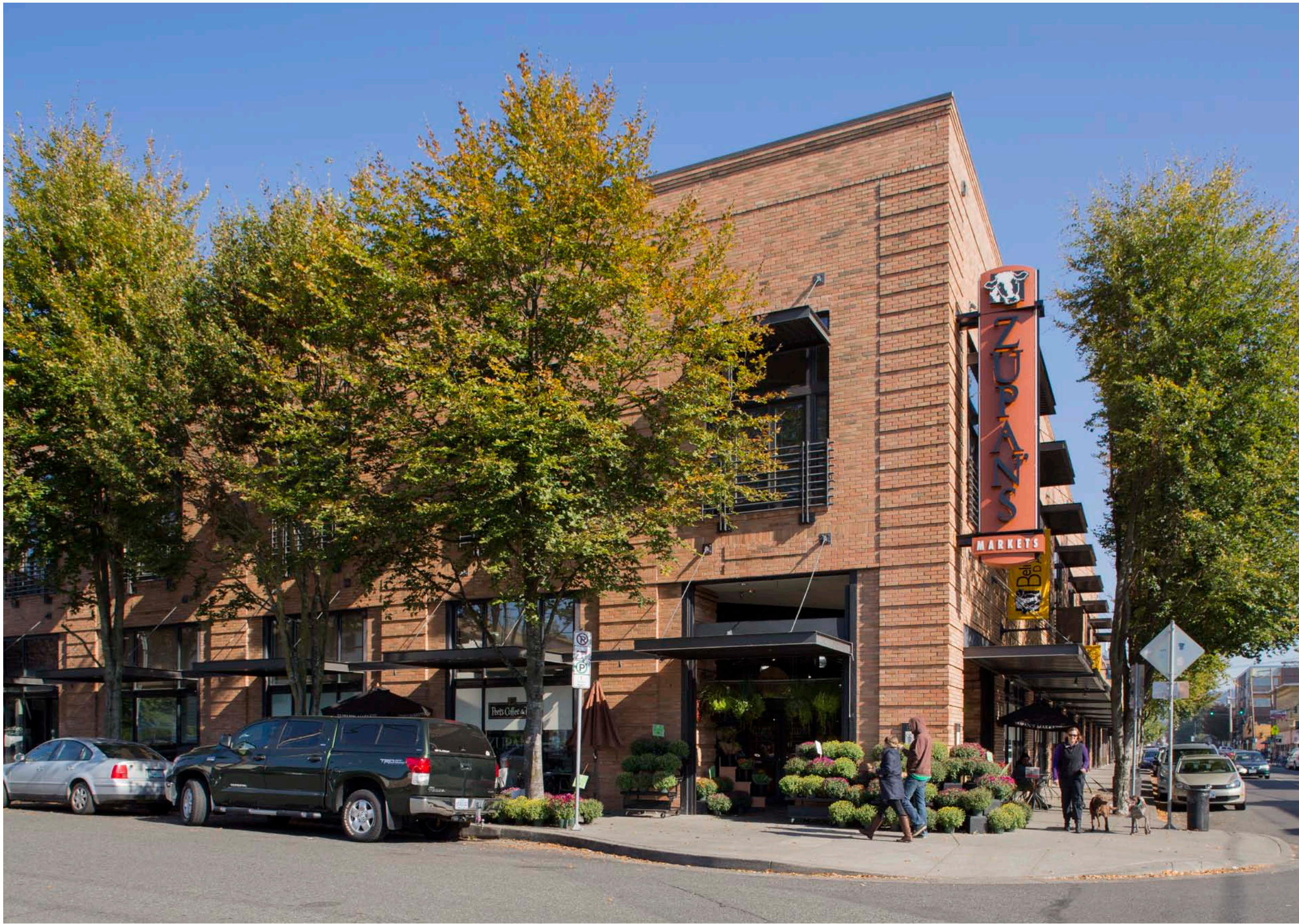
Mix of Uses