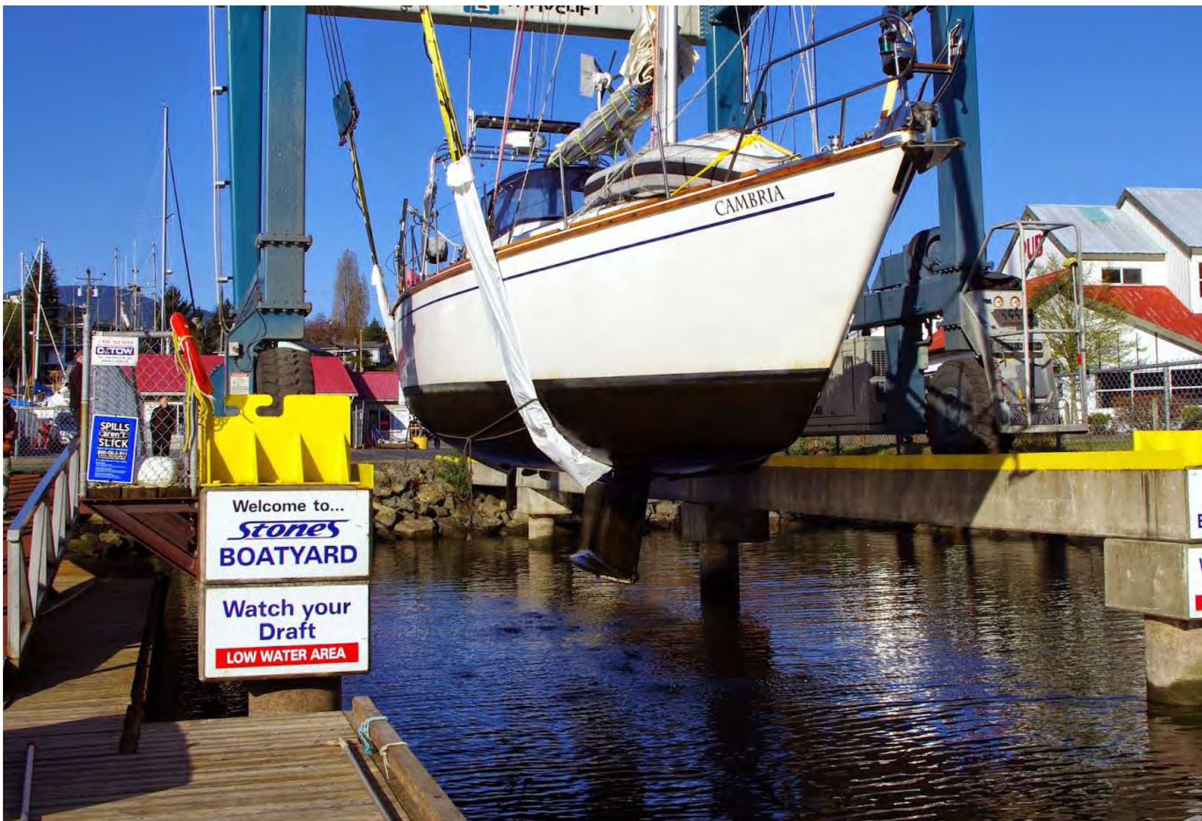
Light Industrial/Marine Commercial