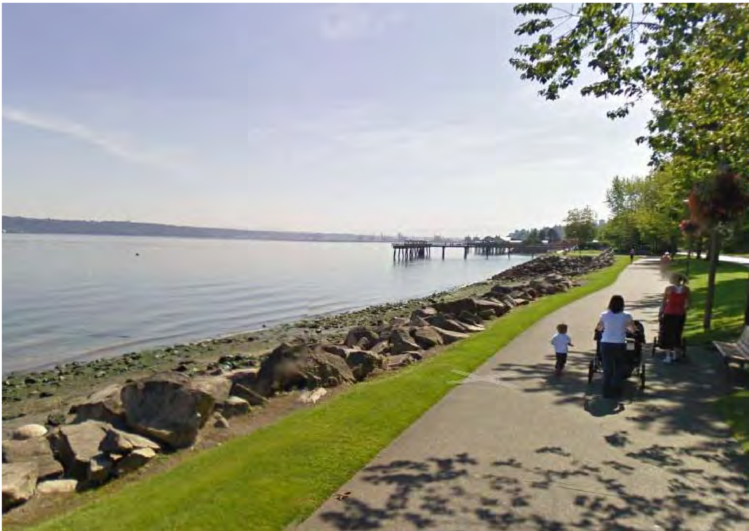
Narrow Open Space (25')